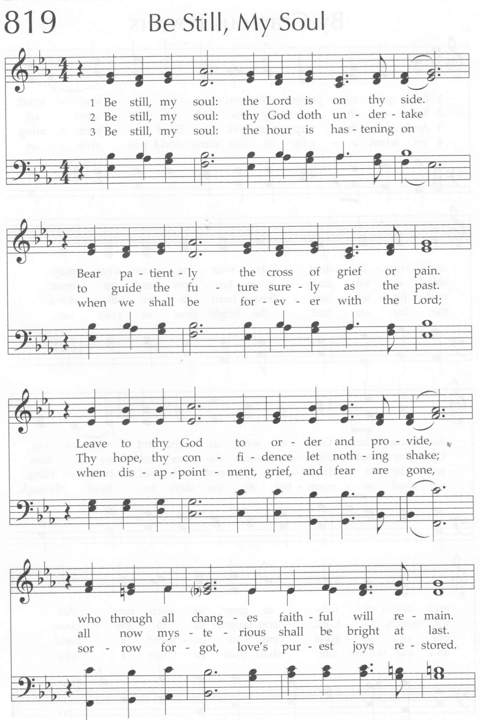
This meditative text seems to be rooted in Psalm 46:10, "Be still and know that I am God," while also reaching forward to 1 Thessalonians 4:17b, "we will be with the Lord forever." Much of the appeal of this hymn comes from its tune, named for the tone poem on which it is based.